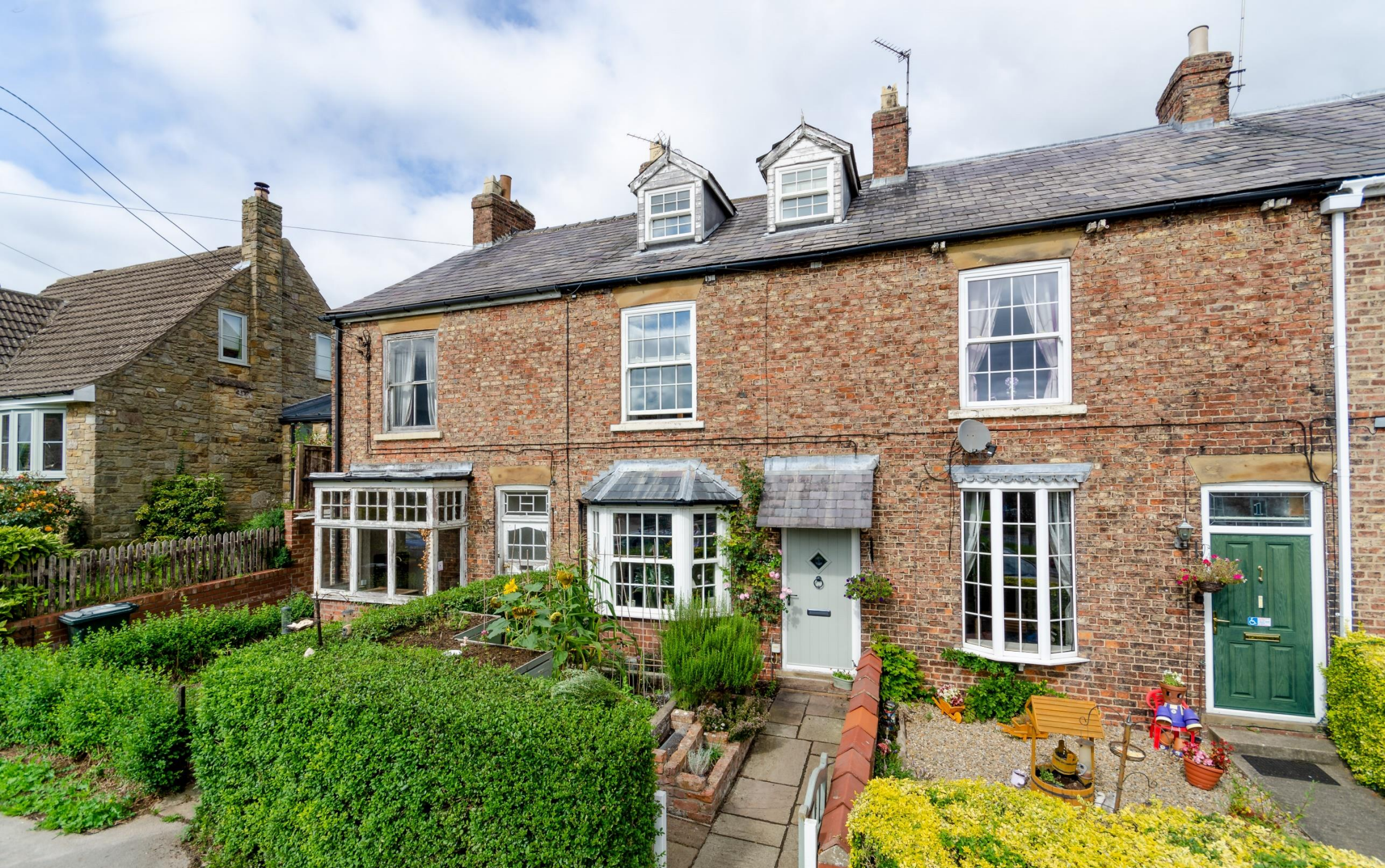
Mole Cottage, The Square, Sheriff Hutton, York, YO60 6QX